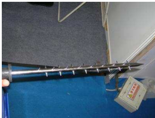
Left: Sting stick purchased from a Chinese supplier for the Dispatches documentary 'After School Arms Club' broadcast on Channel 4 TV (UK), April 2006.