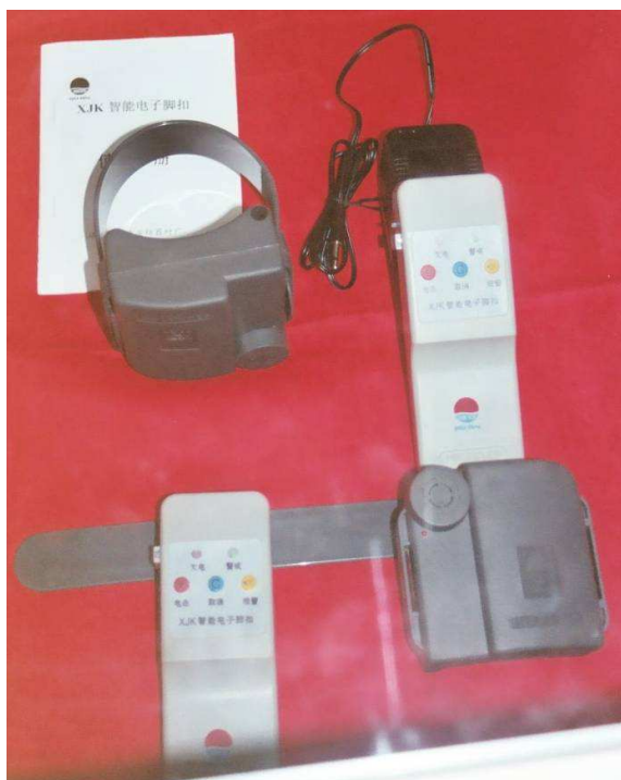
Above: Electric-shock 'fettlers' photographed at Chinese policing equipment trade fair, 2004. Functionally similar US-made electric-shock stun cuffs have been promoted by at least two Spanish companies.

Although Amnesty International and Omega are unaware of any EU-based manufacturers of electric-shock stun restraints, and there are a relatively small number of reports of EU companies promoting or distributing such devices, 132 at least one Spanish-based trader has offered US-made 'stun cuffs' for sale since after the introduction of the Regulation (see Section 4.7 below). 133 Amnesty International and Omega have learned that a second Spanish-based trader has also arranged with the US-based manufacturer of these devices to promote 'stun cuffs' to potential users within other Member States. During 2009, this firm imported a 'stun cuff' device into the EU for demonstration purposes, although without yet making any sales. 134 While imports and exports of functionally similar stun belts into or from the EU would be prohibited by the Regulation, the transfer of stun cuffs or other electric-shock stun restraint devices may not yet be banned.