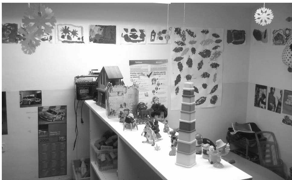
A pre-school in Čakovec, Croatia, attended by Romani children.

A Romani child from the Međimurje region, Croatia, talking about her experience in school.