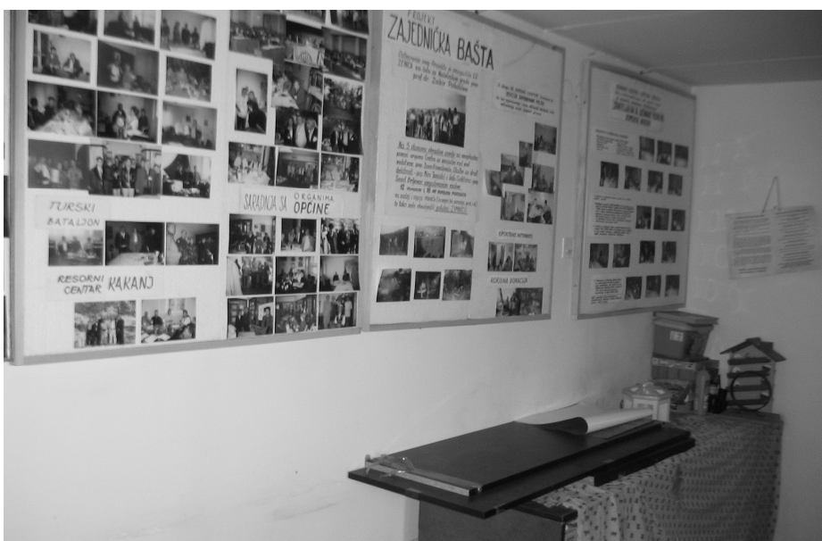
The office of the association Romano Centro, in Zenica (BiH), where activities for Romani children are organized.

communities are even less likely to find employment because of discrimination as well as lack of educational qualifications. Estimates based on the number of Roma receiving social assistance suggest that approximately 70 per cent of Roma in BiH are unemployed. 62 Other sources report that as few as 2 per cent of Roma are employed. 63 Romani women face particular difficulties in the BiH labour market. In a recent poll of 197 Romani women, only 10 were employed and of those only three had a permanent job. 64