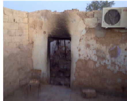
Burned home in Hijara following armed clashes in March. May 2012

Residents told Amnesty International that when they returned after the hostilities, they found their homes damaged and in some cases burned and destroyed. Video footage shows Arab militias entering these neighbourhoods, seemingly after the population left. In at least two instances, they are carrying gas canisters. Amnesty International saw homes in the Hijara and Nasriya areas that appeared to have been deliberately set on fire.