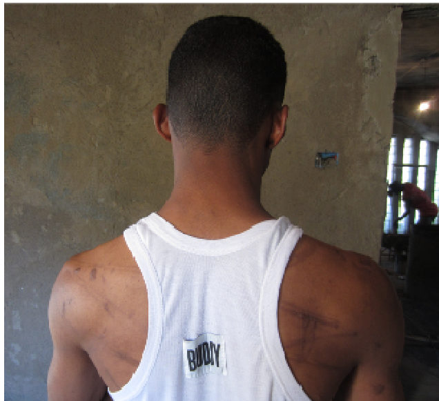
Former detainee shows Amnesty International his scars as a result of beatings. He was released without charge after three days in the custody of armed militias. May 2012

"I was first blindfolded. Then, they took me to an office, I think, and made me lie face down."