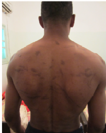
Man from Traghan shows Amnesty International his torture marks. May 2012.

Nine Tabu armed men in military dress captured a