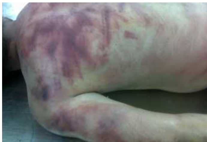
Amnesty International documented more than 20 deaths in custody at the hands of militiamen since September 2011.

Amnesty International gathered detailed information about at least 20 cases of deaths in custody at the hands of armed militias across Libya since September 2011. Medical records and forensic reports, examined by the organization, confirmed that the deaths were the result of abuse – mostly prolonged beatings, leading to internal bleeding and acute renal failure. In at least two cases, detainees died