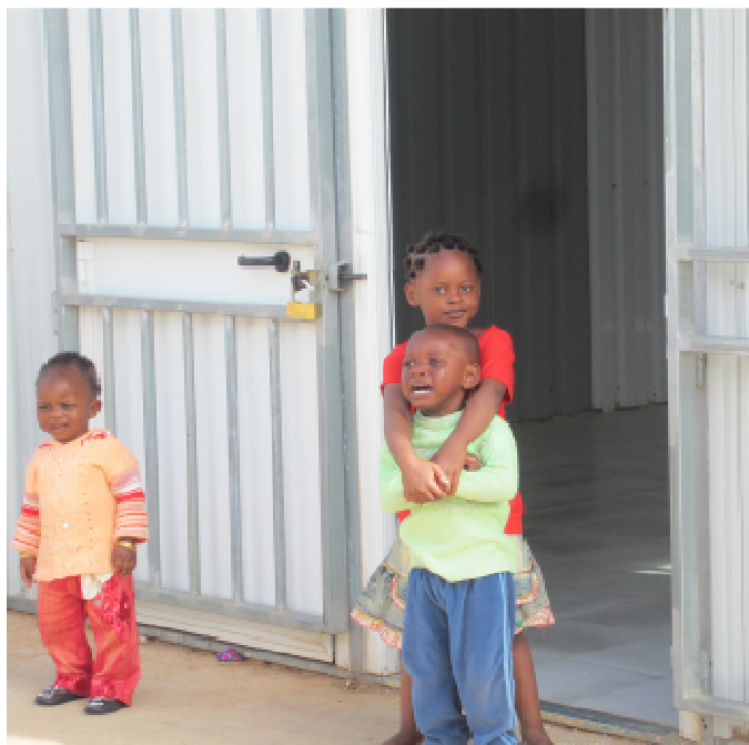
Children at Bou Rashada detention centre for migrants. More than 1,000 men, women and children are detained at Bou Rashada by an armed militia for being “undocumented migrants”. May 2012.

During Colonel al-Gaddafi’s rule, foreign nationals – particularly those from Sub-Saharan Africa – lived with uncertainty and fear of changing policies, arbitrary arrest, indefinite detention, torture and other abuses. After the “17 February Revolution”, their situation was made more difficult by the general climate of lawlessness, the proliferation of arms among the population, and the failure of the authorities to tackle racism and xenophobia, fuelled by the widespread belief of the involvement of “African mercenaries” in the armed forces of the toppled government.