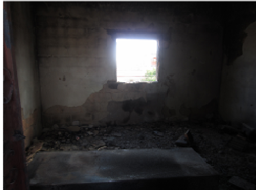
Burned house in Traghan as a result of attacks by Tabu militias in October 2011. Residents complain that they have yet to be compensated for their losses by the NTC. May 2012