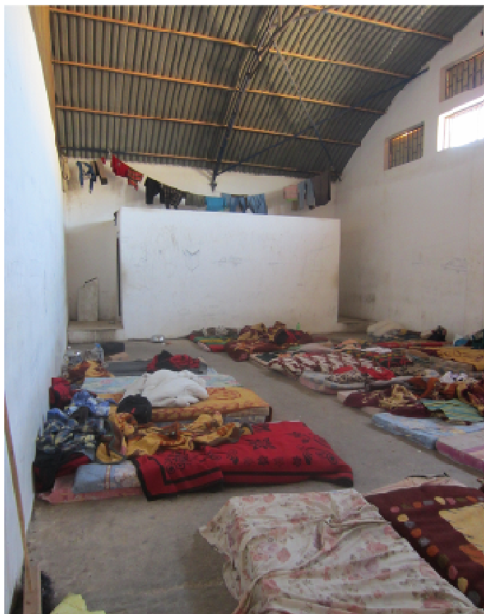
Cell at Ganfouda detention centre. More than 225 people from various nationalities including Somalia, Pakistan, Sudan, Chad, Egypt, Eritrea, and Ethiopia were detained in Ganfouda in May 2012.

At the Ganfouda detention centre, a different approach is taken in regards to nationals from Somalia. A member of the armed militia controlling the centre and the director explained to Amnesty International that they search for work opportunities through “Libyan sponsors” for detained foreign nationals. In these work schemes, they prioritize “good Somali Muslims” if they have valid passports, their embassies vouch for them and they have “no contagious diseases”.