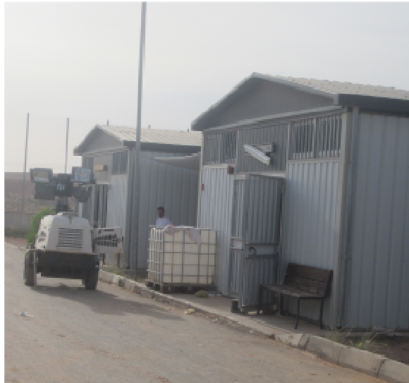
Bou Rashada detention centre. May 2012.

A rubbish collector from Mali, who had lived in Libya for three years, was stopped along with 10 other Malians and four Nigerians from their home in Ain Zara, Tripoli, in late March. He said that they were taken by a group of six or seven men in military dress, put in 4x4 vehicles and driven about 100km to an armed militia base near Gharyan, where other Libyans and non-Libyans were detained. He said: