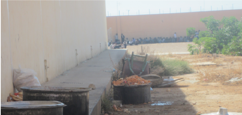
Foreign nationals detained in Ganfouda including Somalis and Eritreans. They have no possibility to apply for asylum or challenge the legality of their detention. May 2012

Detention centre officials acknowledge that nationals of Somalia and Eritrea cannot be sent back to their home countries. There is nonetheless no standard approach to address the situation of such individuals in need of international protection.