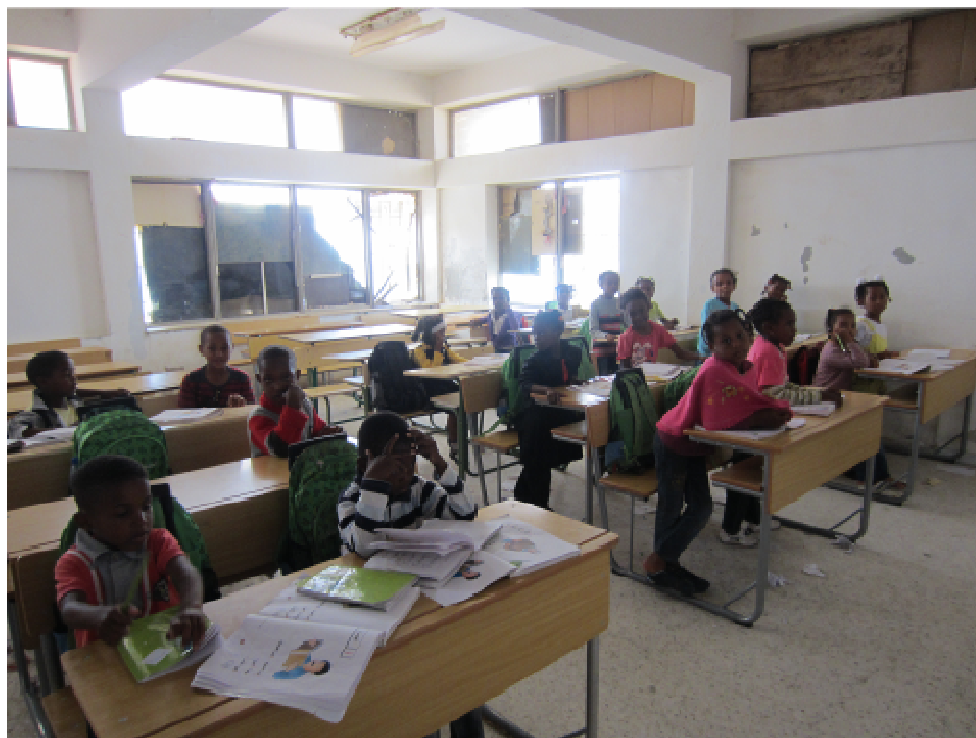
Displaced Tawargha children in poorly resourced classrooms inside the Janzour Naval Academy IDP camp. May 2012.

The authorities have also failed to resolve the situation of entire communities displaced during the conflict and unable to return to their homes, which were looted and burned by armed militias seeking revenge. Entire towns and villages were deliberately rendered uninhabitable by the militias, which accused the displaced communities of supporting the toppled government and of committing crimes on its behalf. The entire population of the city of Tawargha, estimated at 30,000, was driven out by Misratah militias and remains scattered across Libya, including in poorly resourced camps in Tripoli and Benghazi. 7 The Mashashiya community from the areas of Awaniya, Zawayat al-Bajoul and Omer in the Nafousa Mountain faces a similar plight at the hands of Zintan militias. Their suffering intensified following armed assaults on Sgeiga and Mazda in June – home to Mashashiyas – including those who sought shelter after being displaced during the conflict. The violence led to 105 deaths, according to government estimates, and further displacement. 8 Not only are such communities barred from going home; they also continue to face arbitrary arrest and other reprisals.