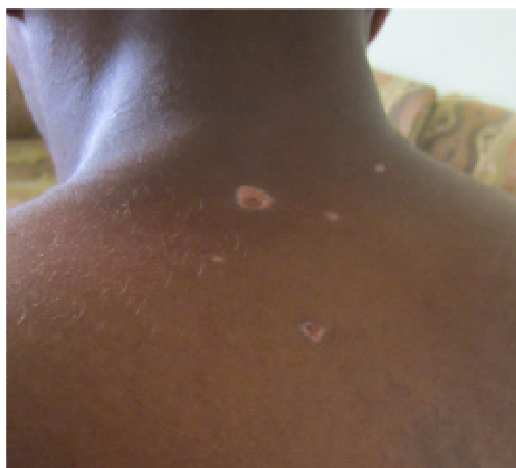
Tabu young man shows Amnesty International marks left by cigarettes burned on the back of his neck in detention. May 2012