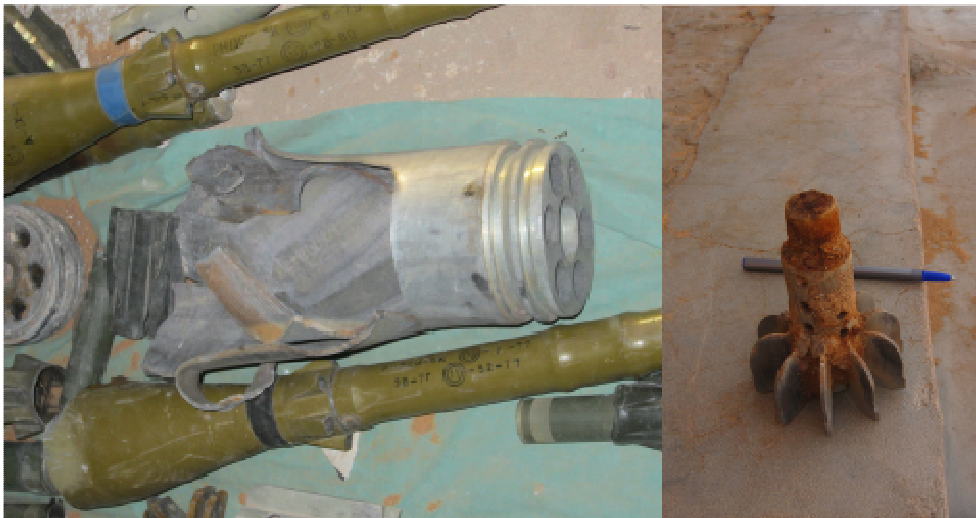
Remnants of weapons found by Amnesty International following clashes in the cities of Sabha and Kufra. May 2012.

Despite releases and the referral of some suspects to relevant civilian or military prosecution offices, progress in charging detainees with recognizably criminal offences has been extremely slow. Some detainees have been held without charge for a year. With rare exceptions, detainees have no access to lawyers and are interrogated alone, despite guarantees stipulated in the Libyan Code of Criminal Procedure. 6 The Minister of Justice told Amnesty International that by June 2012, 164 people had been convicted in common law cases since the end of the conflict. To Amnesty International's knowledge, by early June, only three trials have begun in civilian courts in relation to crimes committed in the context of the conflict, leaving thousands of people detained without trial.