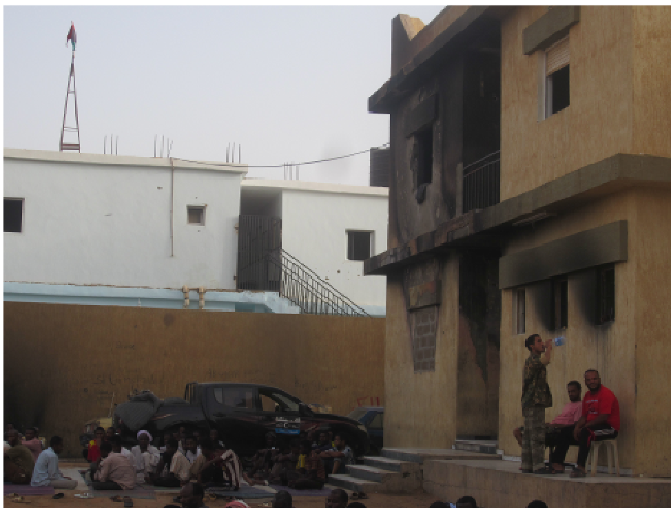
Kufra detention centre. May 2012.

A group of about 20 Somali women, who arrived in Libya after the end of the conflict, told Amnesty International that they were intercepted at sea by two big ships, with Libyans on board, on 29 March. They described embarking at dawn from the coast of Tripoli with some 80 other people of different nationalities, and being intercepted by a Libyan coastguard at about 3pm that day. All of them were immediately taken to a detention centre in Tajoura where they spent a week, before being transferred to the Tweisha detention centre.