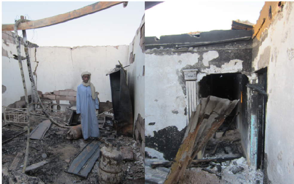
Nasriya residents show Amnesty International their burned and damaged homes, after an assault by Arab militias in March 2012. May 2012

Local residents in Nasriya, a Tabu neighbourhood composed of some 80 families, according to local estimates, told Amnesty International that at about 1.30pm on 27 March, Arab armed militias in tanks and pick-up trucks with machine-guns mounted on top entered their neighbourhood. As the militias advanced, residents escaped and no casualties were reported. When they returned they found their homes and vehicles burned and damaged. Amnesty International assessed the extensive damage and found scores of homes that were charred inside and rendered uninhabitable.