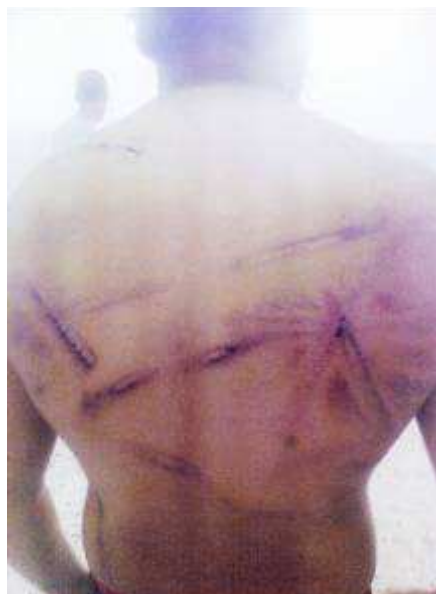
Detainee beaten in Ain Zara prison in May 2012.

17-year-old youth from Beni Walid held without charge by a militia in western Libya since October 2011, speaking to Amnesty International in May 2012