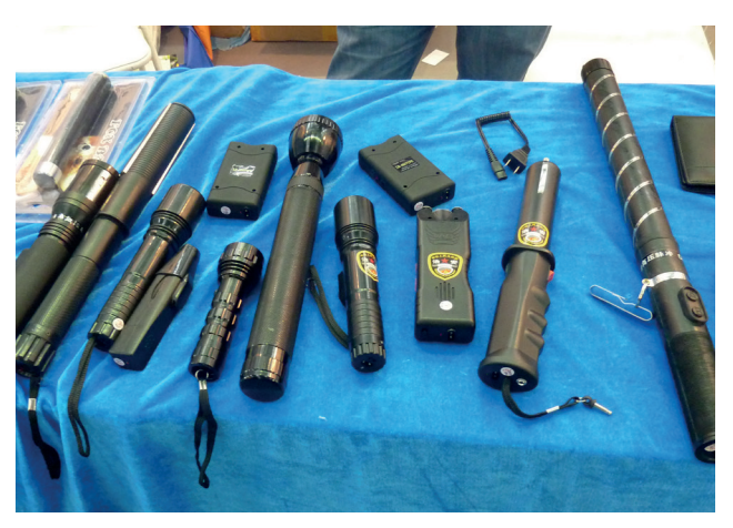
Range of direct contact electric shock weapons on display at an Asian security exhibition

The use of such weapons results in intense, both localised and general pain but not incapacitation of the subject.<sup>10</sup> Potential injuries include burns, puncture wounds and welts, as well as the risk of secondary injuries should the subject fall. Because of their nature and design, direct contact shock weapons carry an unacceptable risk of arbitrary force.