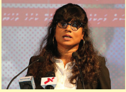
MP Mariya Ahmed Didi

"They... continued beating me with my handcuffs on... They were beating me with batons. Police and military officers then forcefully opened my eyelids. They went for the eye that had been injured [as a result of a police beating] the day before. They sprayed pepper spray directly into my eye. Then they did the same with my other eye. They then sprayed into my nose as they were also beating me. They then took me to a police station