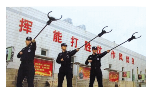
"Shock capturing fork" demonstration, screenshot from Chinese company website.

New products are coming on to the international security equipment market all the time including electric shock gloves, knuckle-dusters and capture devices. In October 2014, a Chinese company announced that it had sold 200 "shock capturing forks" for holding and controlling violent individuals to the Linhe District Public Security Bureau.<sup>15</sup>