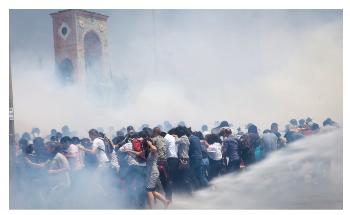
Riot police attack hundreds of protestors on 31 May 2013, Taksim Square, Istanbul

However they can easily be misused, including in prison cells and detention centres, and during large scale policing of public assemblies. 21 When the authorities use RCAs like tear gas in excessive quantities or in confined spaces where people cannot disperse, the toxic properties of the agents can lead to serious injury or death, particularly to vulnerable individuals. In addition, people have died and been injured by being hit directly with RCA projectiles such as tear gas canisters.