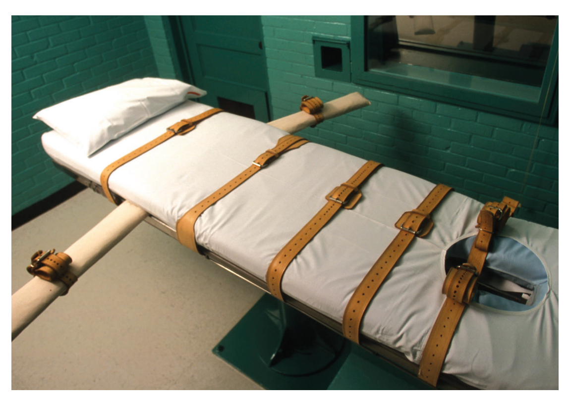
Execution room, Huntsville, Texas, © Getty Images

In China, Guatemala, the Maldives, Papua New Guinea, Taiwan, Thailand, Vietnam, and the United States, the intravenous administration of a lethal dose of certain pharmaceutical chemicals ("lethal injection") is provided for as a method of execution under the law.<sup>28</sup> Amnesty International and the Omega Research Foundation oppose the death penalty in all cases and call for the abolition of the death penalty.