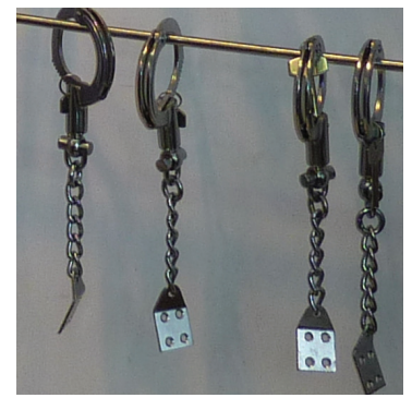
Leg irons, weighted leg irons, and fixed cuffs