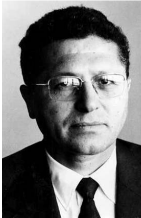
Mansur al-Kikhiya, a prominent Libyan diplomat and human rights activist, “disappeared” in Cairo, Egypt in 1993. His fate and whereabouts remain unknown.