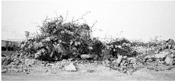
A house in Bani Walid demolished as a result of the policy of collective punishment ©AI, February 2004

While in Bani Walid, Amnesty International delegates met “offenders” and their relatives, who had been subjected to forms of collective punishment. Amnesty International was told that on 15 October 2002 six houses belonging to members of the al-Jadik clan were demolished in Bani Walid. Since 1993 members of the al-Jadik clan have reportedly been intermittently subjected to varying forms of punishment, including temporary suspension of basic services such as telephone and electricity, temporary eviction from their homes, not receiving a salary for prolonged periods, not being allowed to study or to work and being asked to leave the area.