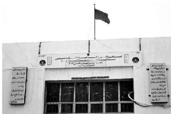
Local branch of the People’s Committee for Justice and Public Security in Bani Walid, where Amnesty International delegates met local officials. The right hand plaque gives a definition of “heresy” ( zandaqa), signed in the name of the Leader of the Revolution. It says, “ hostile intelligence work prepared in the framework of a strategy against religion and the nation ”.

This “Charter of Honour” establishes the notion of collective responsibility for the actions of others at three main levels: the family; society; and at an official level. Further, the text of the Charter allows for the application of collective punishment to all members of a given group, whether small or large, believed to be linked to the “crime”. As punishment, the Charter prescribes in broad terms deprivation of public services and publicly-funded projects. It appears that this can mean being deprived of the right to participate in the Basic People’s Congress and of the right to benefit from public services, such as electricity, water and telephone, as well as access to food supplies, social benefits or basic administrative services.