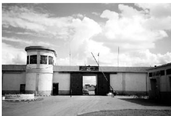
Entrance to al-Kuweifiya Prison in Benghazi.