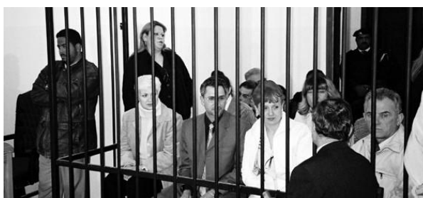
Defendants in the so-called HIV trial during a hearing at the Benghazi Court of Appeal on 16 February 2004.

While Amnesty International recognizes the pressing need to bring to justice anyone responsible for the tragic consequences for these children and their families, it is imperative that the rights of the accused are respected at all stages, from the moment of their arrest. It is only by means of a fair trial that follows due legal process that the truth will emerge about how these children became infected with the HIV virus and those responsible be held fully to account.